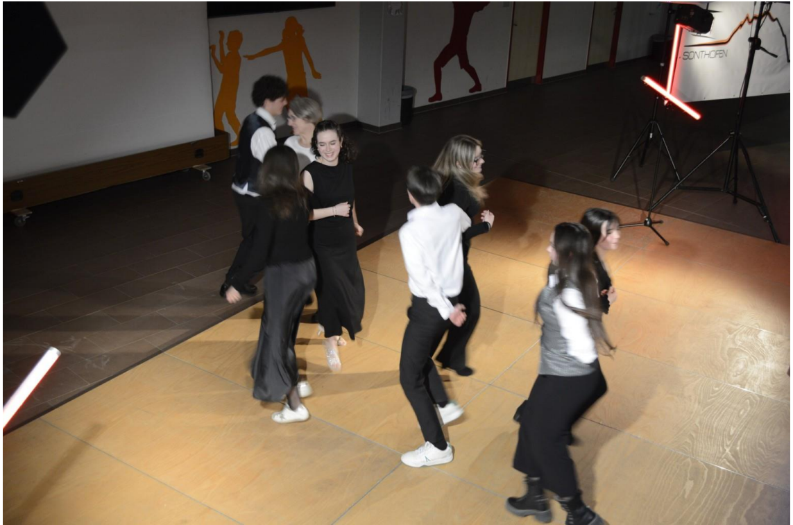
spectacular performance of Bassano including a dance and a traditional song, sang by two students