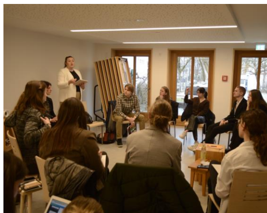
Committee 3 is working hard

But before that the Sonthofen Staff members served us an incredible meal at the Haus Oberallgäu.