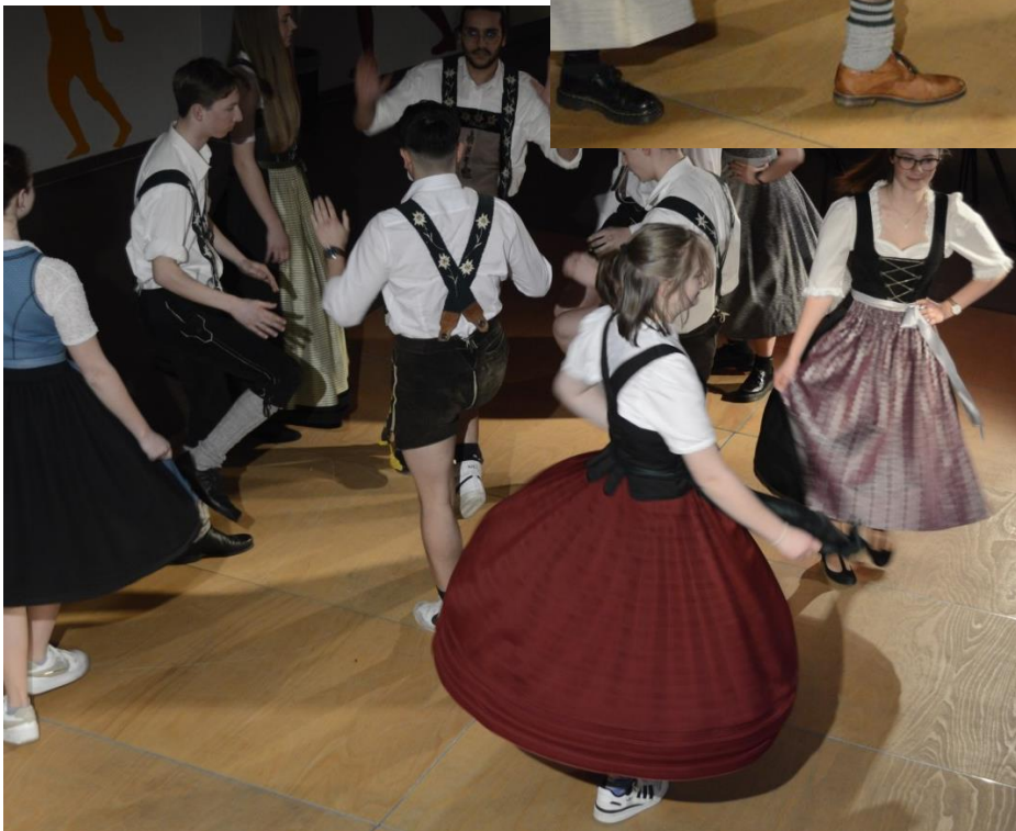
A lot of turns done by the Sonthofen Delegation