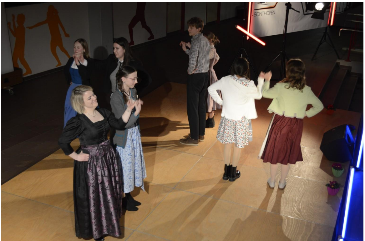
Another nice dance was presented by the delegation of Rosenheim