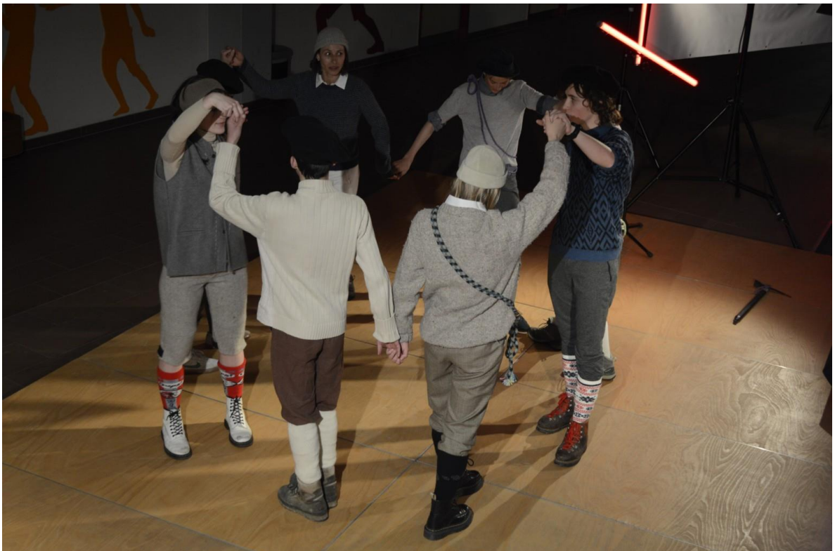
The French delegation