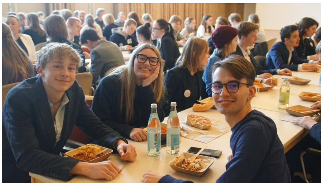
Lunch at the Haus Oberallgäu

After that the discussions picked up once again in the world café with the experts to optimize their postulations. Now we're looking forward to the karaoke evening with the whole YPAC Delegation. We hope you have fun!