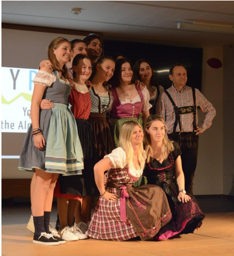
The Merano Delegation in their traditional clothing