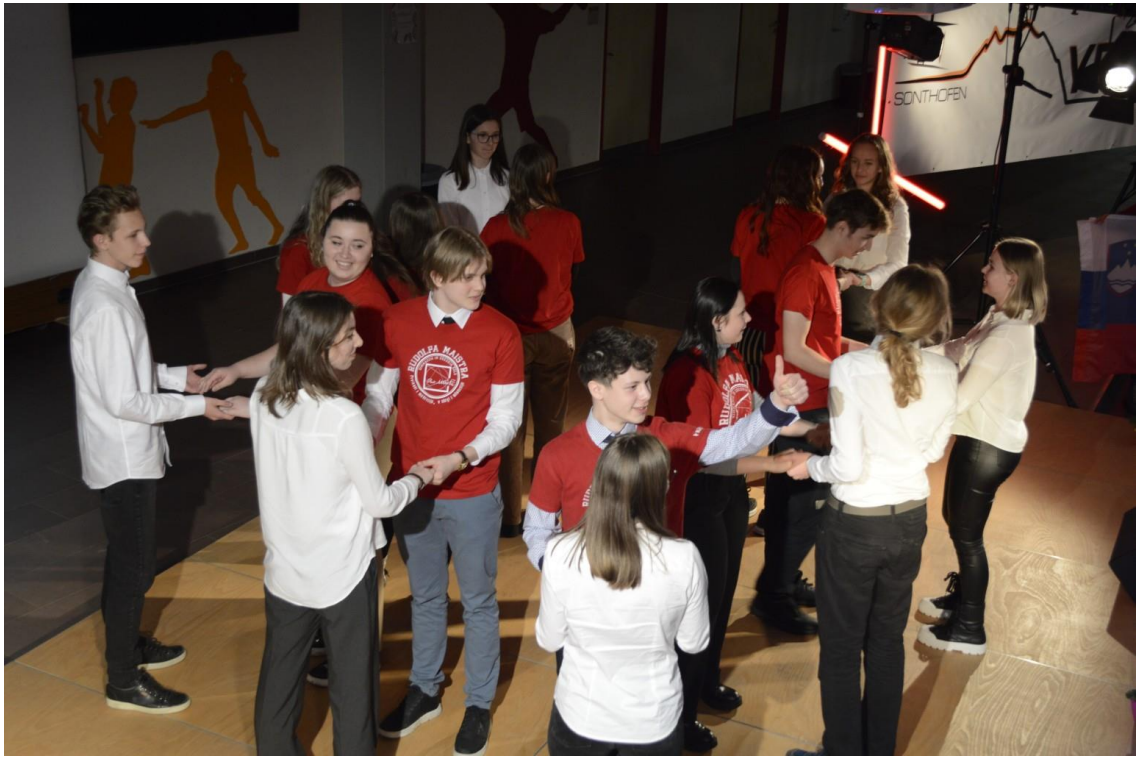
The joint dance of Kamnik and Maribor