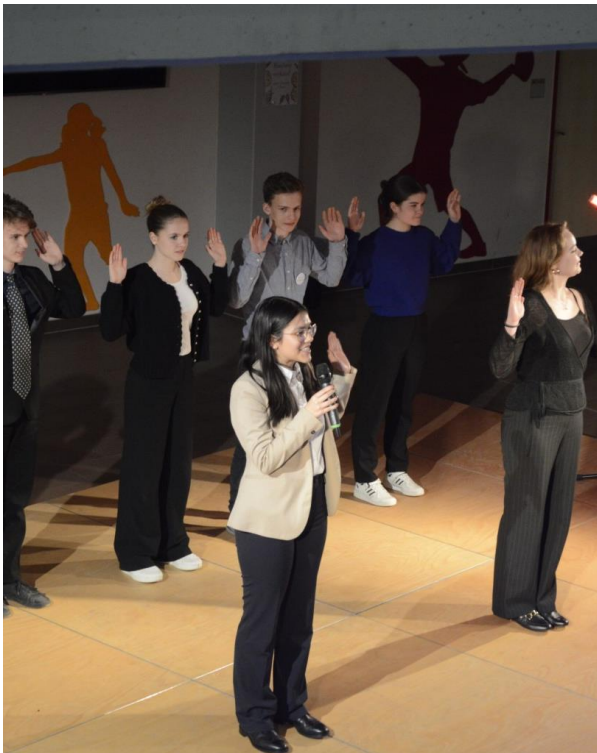
A "Plattler"-Tutorial by Innsbruck